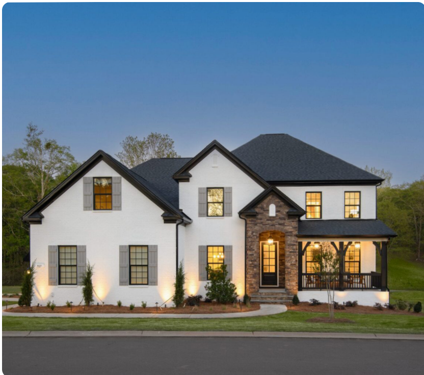
River Reserve by Empire Homes