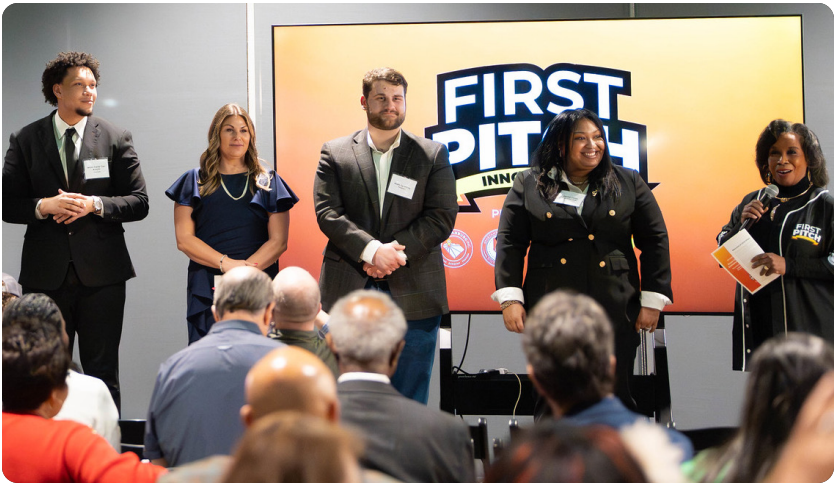
Power Up First Pitch contestants