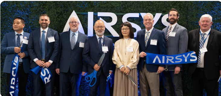
AIRSYS Cooling Technologies Ribbon Cutting

The number of white-collar jobs based in Spartanburg County increased by 23 percent between 2015 and 2025 , well above the national average of 15 percent.