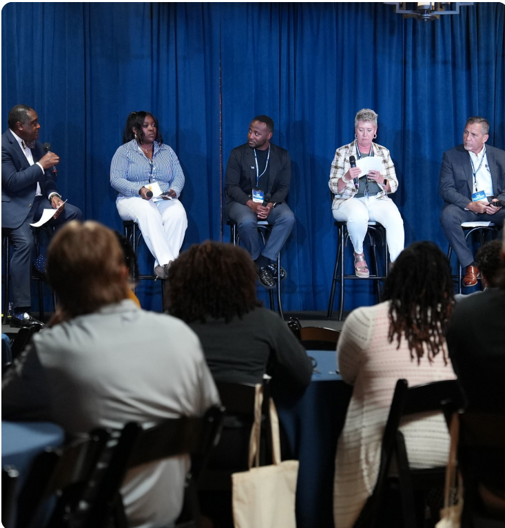
Small Business Summit Panelists

OneSpartanburg, Inc. and Spartanburg County partnered to host the second annual Spartanburg Small Business Summit , designed to connect small businesses with the tools and resources they need to take their business or big idea to the next level.