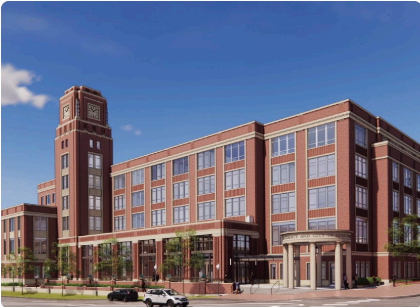
Joint Government Center Rendering

OneSpartanburg, Inc. and the City of Spartanburg have partnered on efforts to support stakeholders through downtown’s era of transformation, including establishing a Downtown Manager role . New signage, a revamped Downtown website, and the See Spartanburg Rise campaign are designed to improve patrons’ experiences throughout and beyond construction.