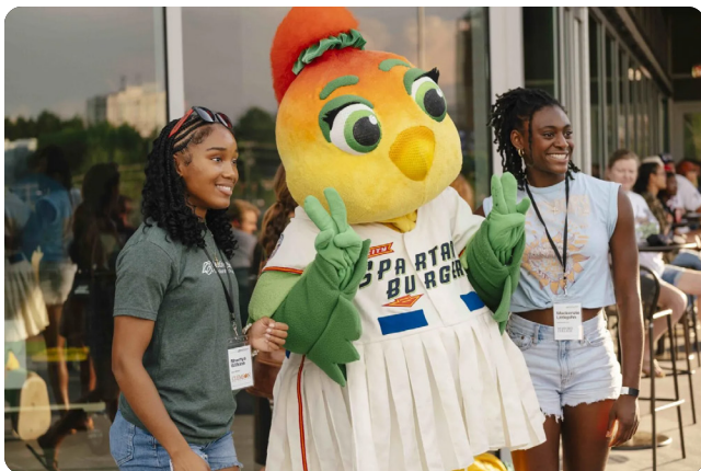
Spartanburg Meeting Street Scholarship recipients honored at Spartanburgers game

Big Mo , launched in fall 2025 by Spartanburg Academic Movement and funded by Movement 2030, is designed to help local students chart their next step after high school through one-on-one guidance and financial support. As of May 2026, 52% (1,928 students) of Spartanburg County's graduating class of 2026 had signed up to take advantage of Big Mo.