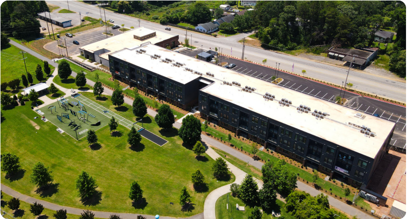
Boxcar Apartments along Mary Black Rail Trail

Economic impact data showed that a total of $219M has been invested or announced in trailside multi-family and mixed-use developments. This includes the new Boxcar Apartments, the new location of Ciclops Cyderi & Brewery, and more.